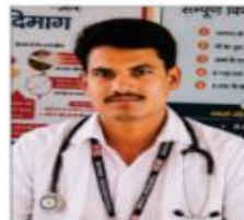
Umashankar Dist.- West Champaran